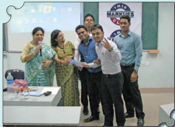
WIN A DEAL - A MARKETING GAME