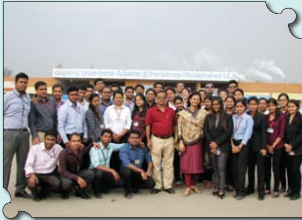
INDUSTRIAL VISIT TO PARADEEP PHOSPHATE LTD. AND ORICLEAN PRIVATE LIMITED