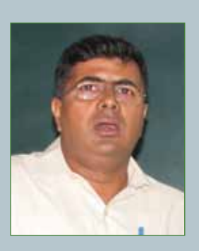
"Session was really great and the participants are very active and interactive also. Love to come for a session once again."