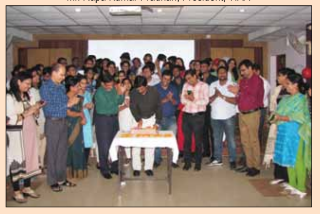
Teachers' Day Celebration at Campus