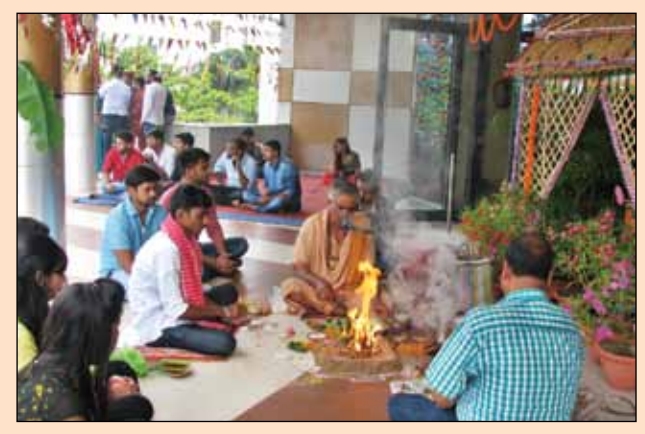
Ganesh Puja Celebration at Campus