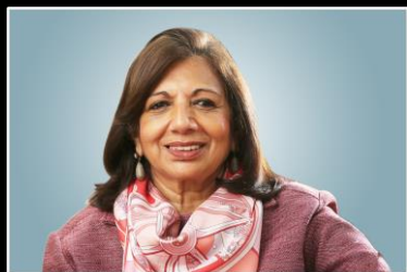
Dr. Kiran Mazumdar-Shaw (Chairperson, Biocon)

Kiran Mazumdar-Shaw is a first-generation entrepreneur and global business leader with over four decades of experience in biotechnology. Fueled by her passion, she started her biotech journey in 1978 from her garage in Bengaluru, India. She set out to prove that women should not be underestimated or denied opportunity due to gender stereotypes. Under her aegis, Biocon has emerged to be a multi-billion-dollar enterprise, which delivers on the promise of making medicines accessible and affordable to millions of patients worldwide. Named the EY World Entrepreneur of the Year 2020 and winner of EOY India 2019 title, Ms. Shaw also appeared on the Forbes 100 most powerful women list 2020. Her goal is to develop affordable blockbuster drugs with the potential to benefit a billion patients.