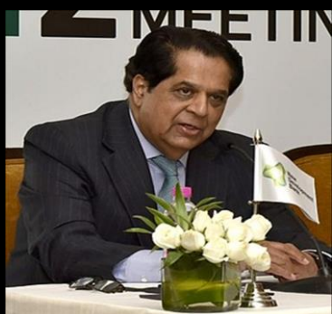
Kundapur Vaman Kamath (Former Chairman ICICI Bank)

Kundapur Vaman Kamath is the former chief of the New Development Bank of BRICS countries, previously he has also served as the Chairman of Infosys Limited, the second-largest Indian IT services company, and as the Non-Executive Chairman of ICICI Bank, India's largest private bank. Kamath also served as ICICI Bank's founder and Managing Director and CEO from 1 May 1996 until his retirement from executive responsibilities on 30 April 2009. Kamath took charge as the Chairman of Infosys from N. R. Narayana Murthy on 21 August 2011. He remained Chairman till June 2015. Before serving in this position, he was the Non-Executive Chairman of the company from 2 May 2011. Kamath also serves as an independent director on the boards of the Houston-based oil services company Schlumberger since 2010, and the Indian pharmaceutical manufacturer Lupin. He is also a member of the Board of Governors of the Pandit Deendayal Petroleum University.