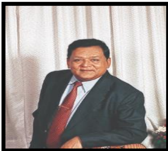
A.M. Naik, Chairman Larsen & Toubro

Anil Manibhai Naik (born 9 June 1942) is an Indian industrialist, philanthropist and the Group Chairman of Larsen & Toubro Limited, an Indian engineering conglomerate, and since 2018, the Chairman of the National Skill Development Corporation. On 15 March 1965, Naik joined L&T, as a junior engineer. A rapid rise followed. He was appointed Assistant Manager within three years and 15 days of joining – a record at L&T. He was promoted as General Manager in 1986. He became Member of board of L&T Limited on 23 November 1989. In 1999, he took over as the Chief Executive Officer and Managing Director. In 2003, he became the Chairman of Larsen & Toubro, the first employee in the Company's history to be elevated to this post. At the helm,